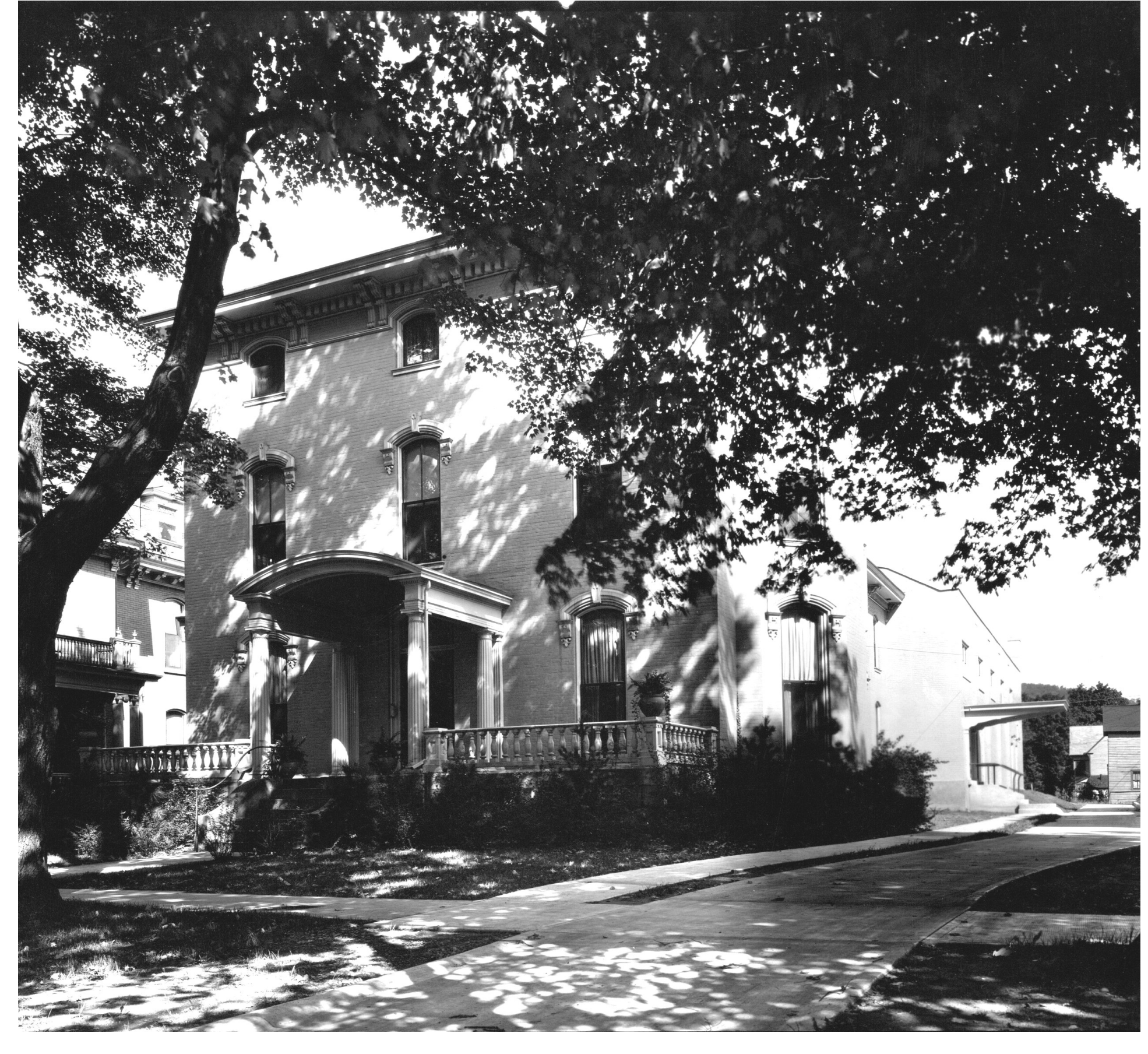
310 MARKET STREET, WARREN

In 1962, Warren was designated as the district library center for 17 public libraries in five counties in northwestern PA and has been appointed by the Warren County Commissioners as the county library. A twelve person Board of Directors appointed by the County Commissioners, the City of Warren, and representatives elected from the Association governs the Warren Library Association.