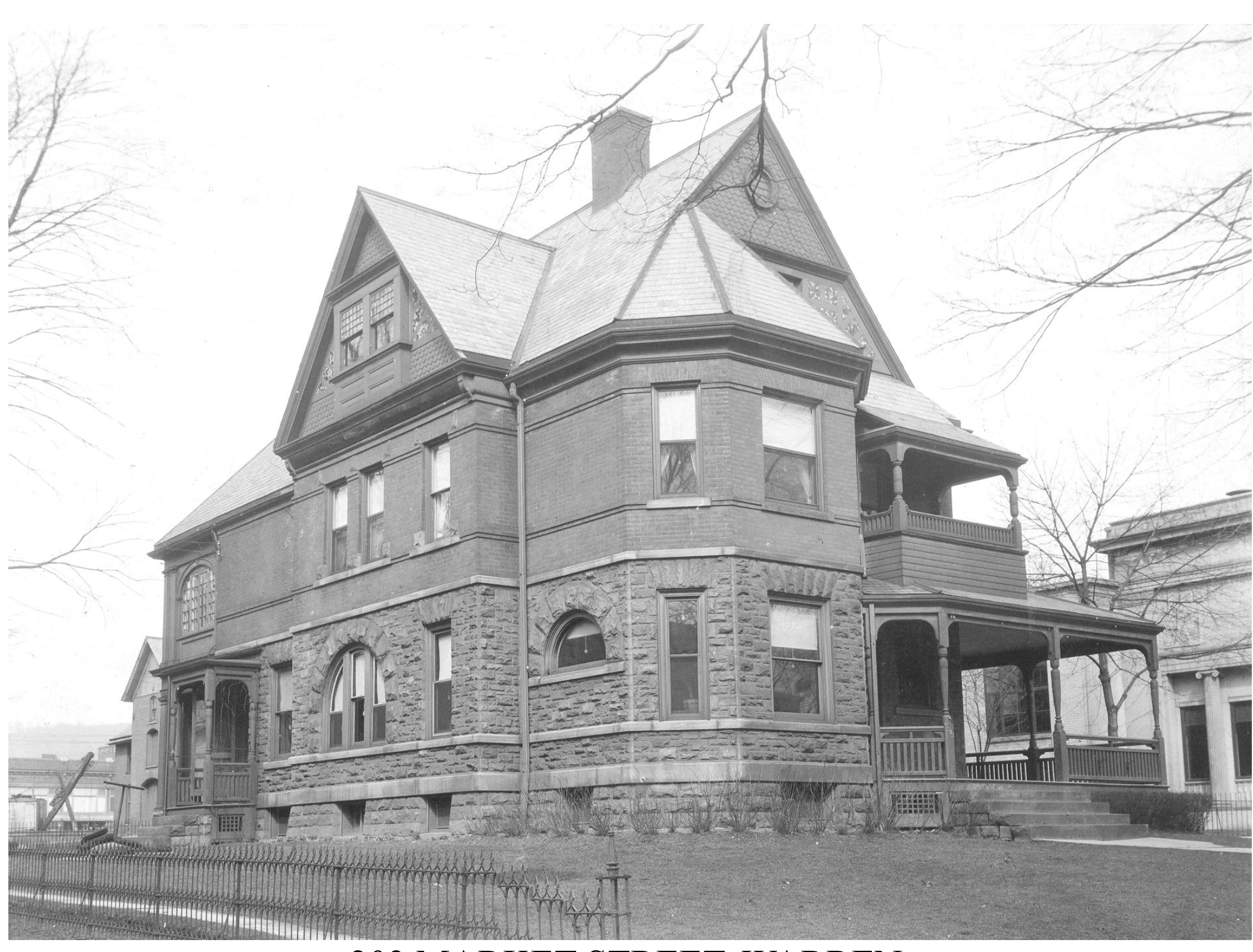
203 MARKET STREET, WARREN

The Conewango Club originated as a gentleman's club but has evolved into a family-oriented, community organization.