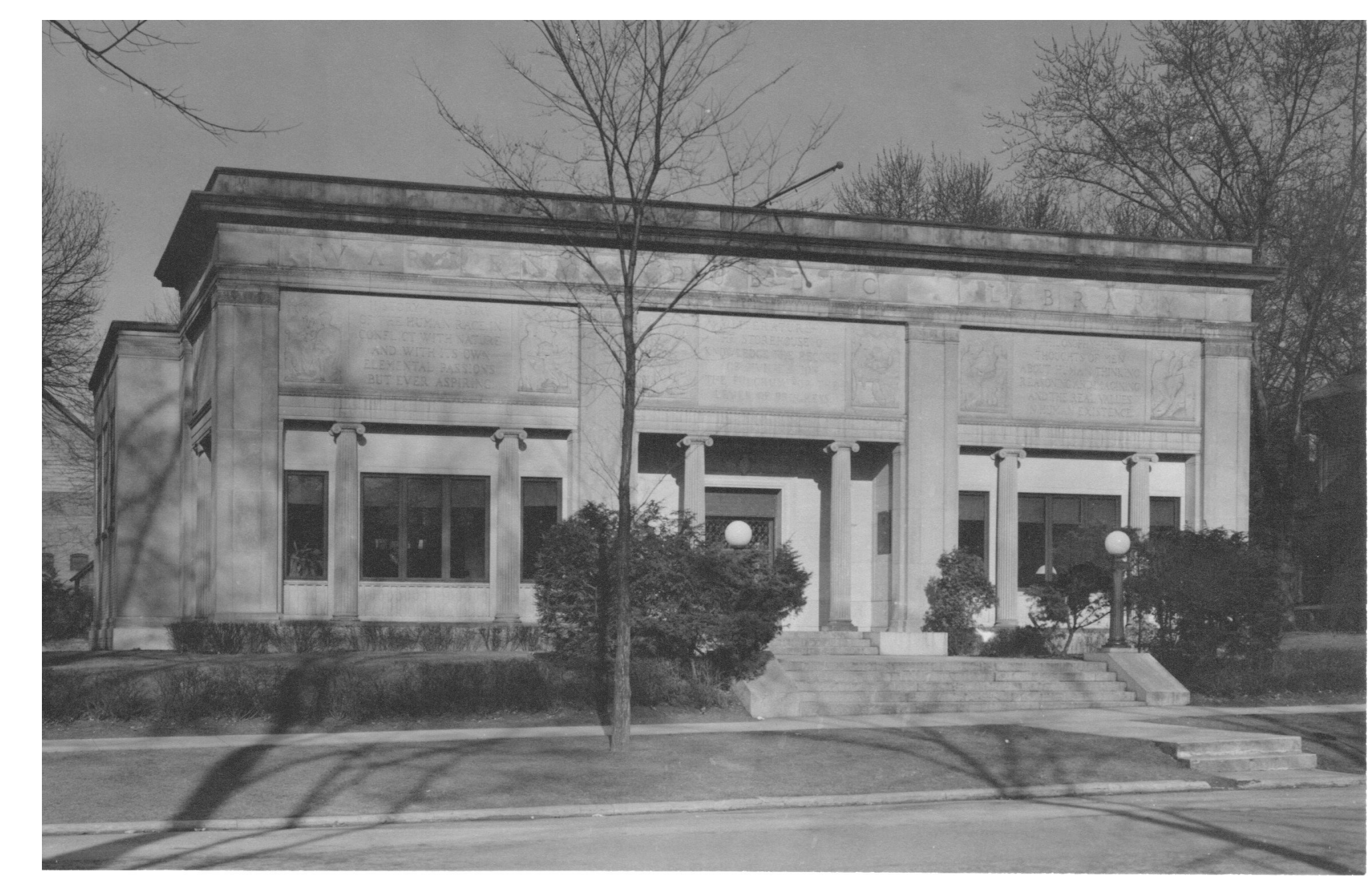
205 MARKET STREET, WARREN

Walkable Warren is a local initiative intended to promote healthy lifestyles by encouraging foot traffic and bicycling as alternative modes of travel in and around the City of Warren. Warren has a wealth of scenic landscapes, historic architecture, public parks, and trails, all worthy of being showcased and that are best experienced on foot or by bicycle. Recommended routes of travel between the Warren/North Warren Bike/Hike trail, core downtown, and a few of our public parks are marked by Walkable Warren signage along our public streets. We encourage you to step out of the automobile as a source of travel and, instead, experience Walkable Warren on foot or bicycle. Pedestrians please use the sidewalks. Bicyclists must obey all traffic laws.